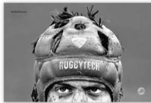
light logo option