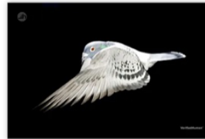
light wordmark option

"The human spirit must triumph over technology."